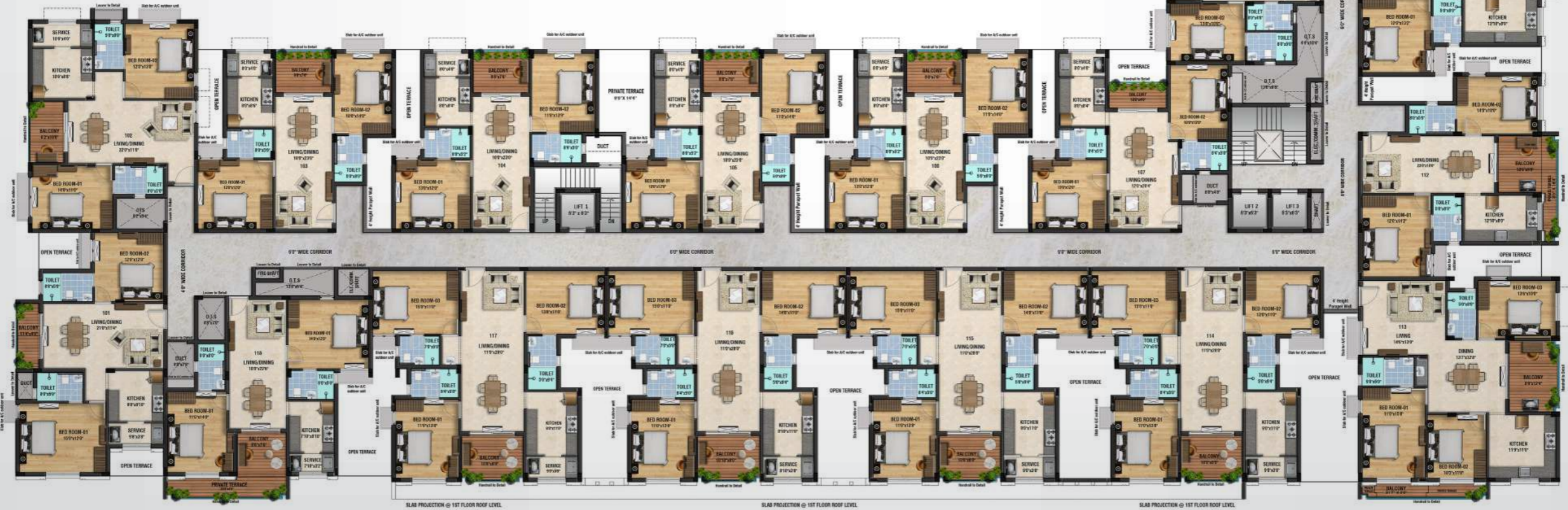
SLAB PROJECTION @ 1ST FLOOR ROOF LEVEL